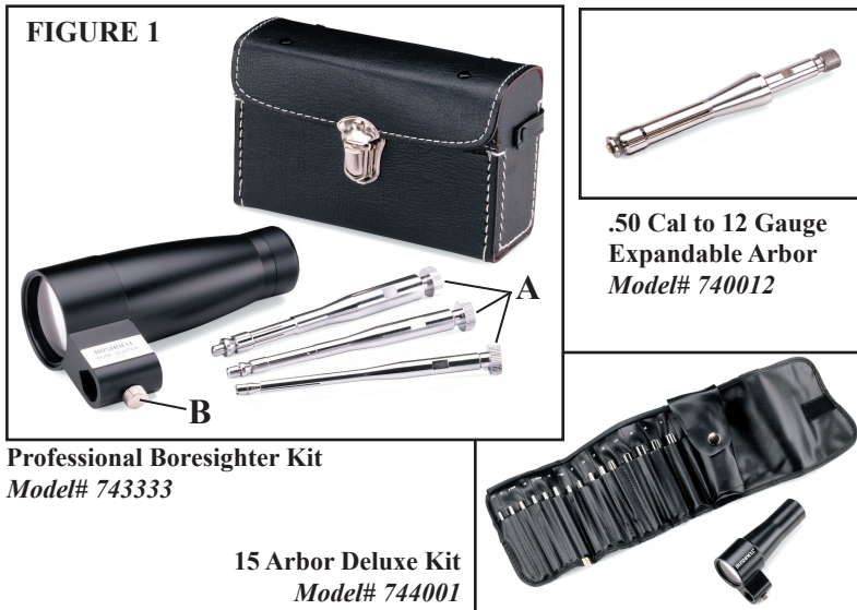
Professional Boresighter Kit Model# 74333